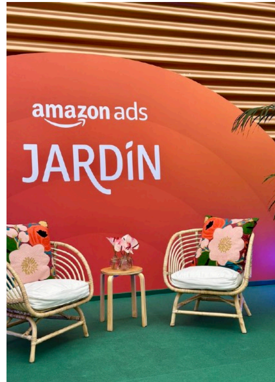
Mobile World Congress