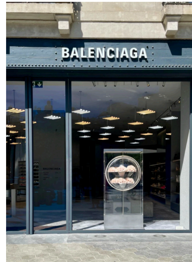
Official florist of Balenciaga in Barcelona