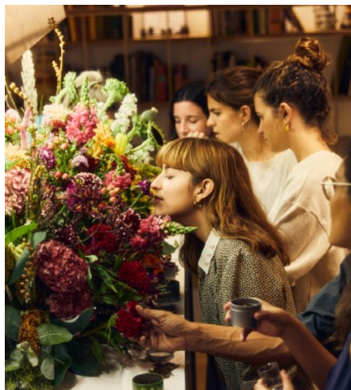
Creative organizations and events