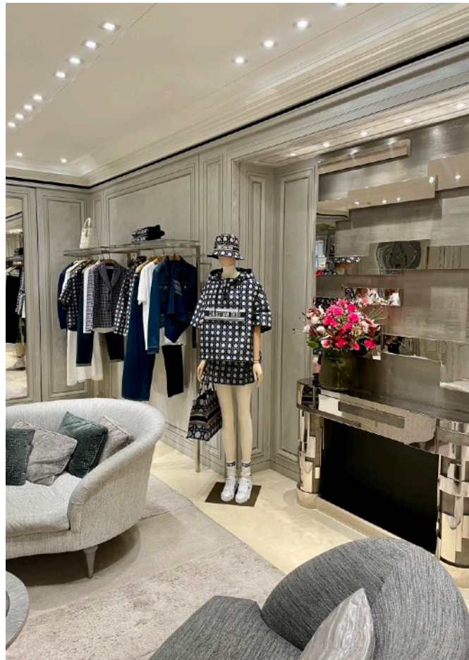
Official florist of Christian Dior in Barcelona

To see all clients and projects we have worked on, please visit our website